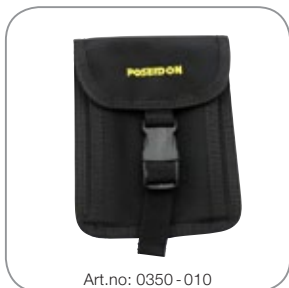
TRIM WEIGHT POCKET