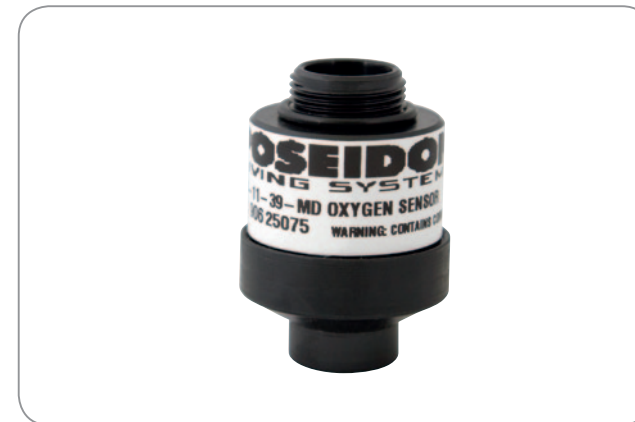
O2 SENSOR (MOLEX)

Oxygen sensors made for the POSEIDON SE7EN.