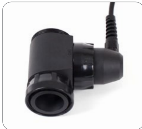
POSEIDON THIRD CELL HOLDER

If you would like to use a third cell during your dives to monitor the loop you will now have that option with Poseidon's Third Cell Holder.