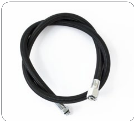
MIFLEX POLYURETHANE 90 CM

A hose that is both robust and high quality.