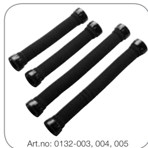
POSEIDON SE7EN BREATHING LOOP SHORTER & LONGER HOSES