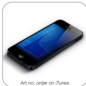
POSEIDON WEDIVE 2.0