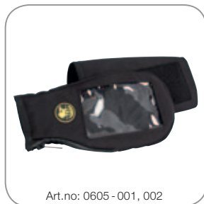
REBREATHER DISPLAY GAUNTLET