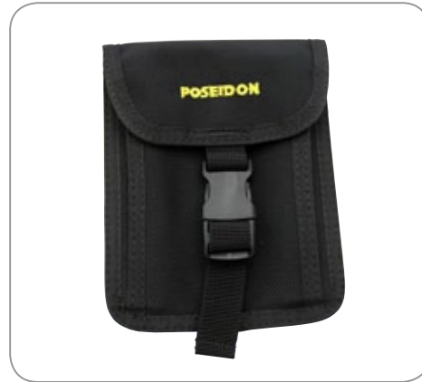
TRIM WEIGHT POCKET