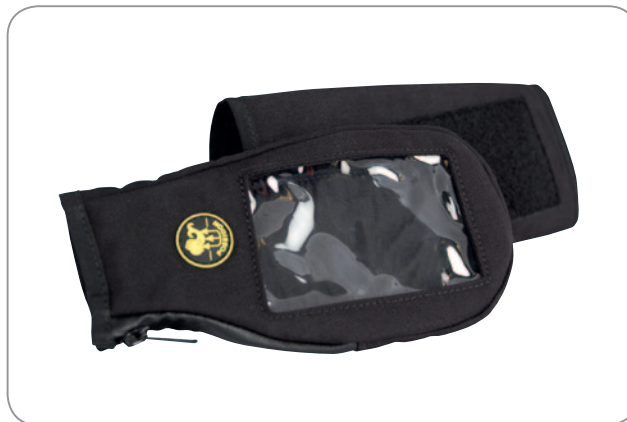
REBREATHER DISPLAY GAUNTLET

The gauntlet will help you keep track of your display, by having it placed on top of your hand.