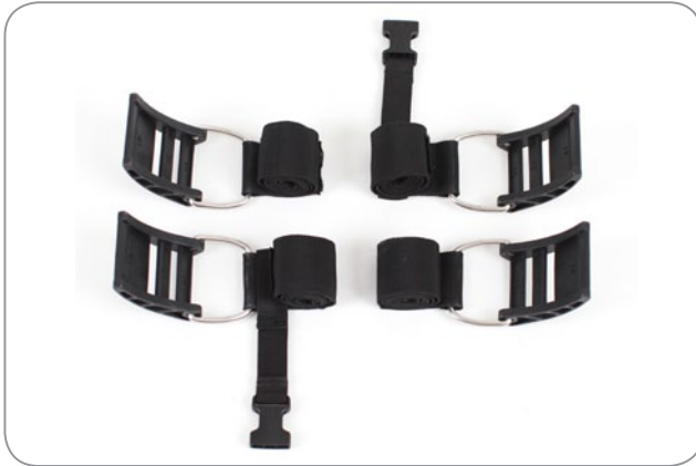
TANK BAND STANDARD

The four tank band straps that can be fitted on to the SE7EN are the same type of tank band that you see on standard BCDs, with the exception that the dimension is smaller to fit the POSEIDON SE7EN's smaller brackets and tanks.