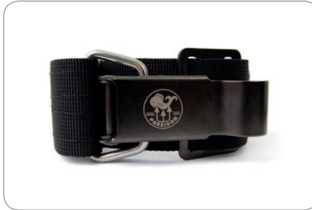
TANK STRAP & BUCKLE

The tank straps with the stylish stainless steel buckles will make the attachment of your diluent and oxygen tanks a much easier operation.