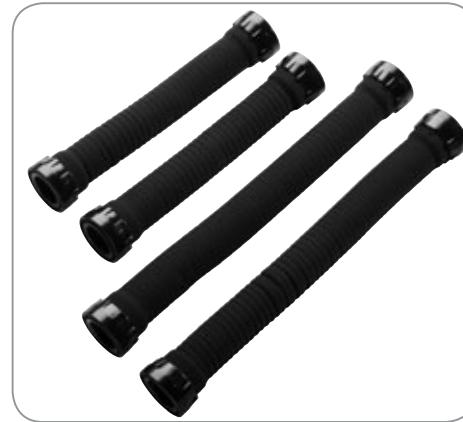
POSEIDON SE7EN BREATHING LOOP SHORTER & LONGER HOSES

These hoses will make it possible for you to customize the lengths of the hoses to fit you better.