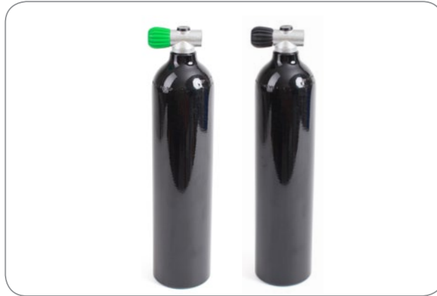
3.0 L STEEL CYLINDERS

When diving in colder waters and you need to wear a dry suit with undergarments you can preferably use the 3.0 L Steel Cylinders.