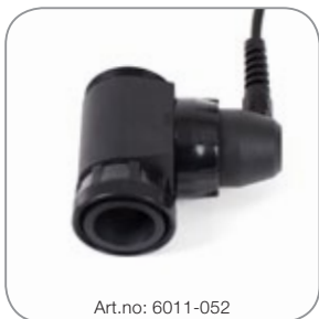
POSEIDON THIRD CELL HOLDER