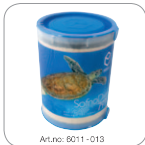
SOFNODIVE 797 SCRUBBER