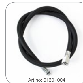
MIFLEX POLYURETHANE 90 CM