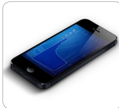
POSEIDON WEDIVE 2.0

Poseidon's intuitive iPhone and iPad app for planning your dives on the Poseidon MKVI.