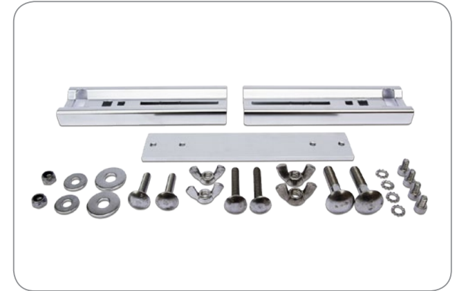
11 INCH ADAPTER

Get your POSEIDON SE7EN canister in place without straps.