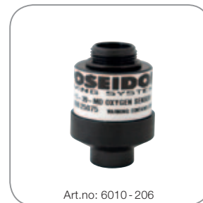
O2 SENSOR (MOLEX)