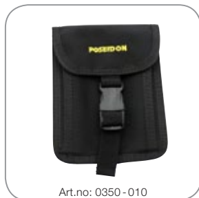
TRIM WEIGHT POCKET