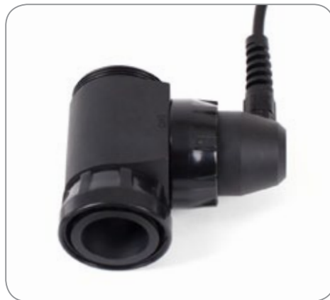
POSEIDON THIRD CELL HOLDER

If you would like to use a third cell during your dives to monitor the loop you will now have that option with Poseidon's Third Cell Holder.