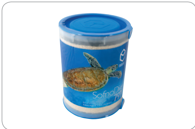
SOFNDIVE 797, PRE PACKED SCRUBBER (2 PCS)

No need to pack the scrubber yourself with the pre packed SofnoDive® 797.