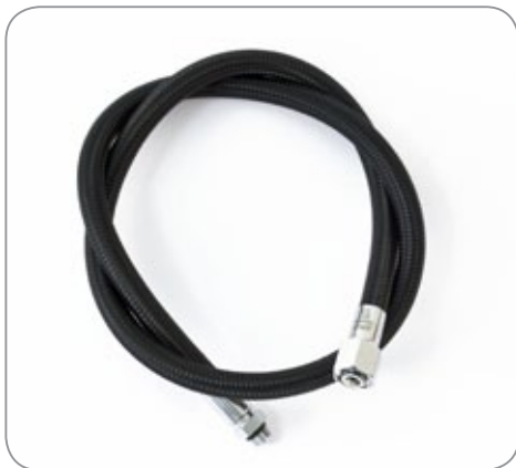
MIFLEX POLYURETHANE 90 CM

A hose that is both robust and high quality.